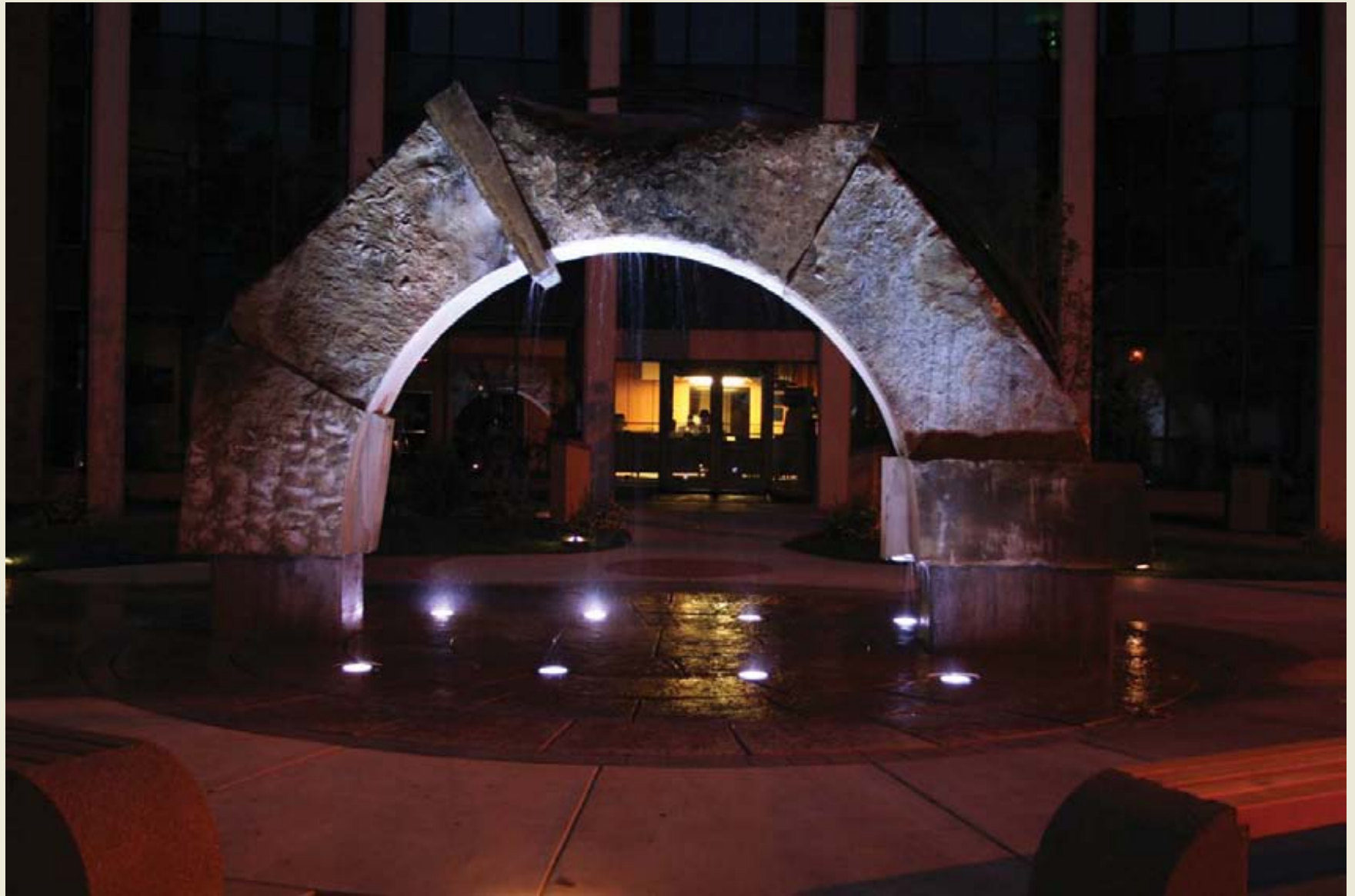
THE WATER FALL ARCH ECHOES THE CURVED FAÇADE OF THE LIBRARY, THE WATER FALL IN HONOR OF THE CITY'S NAME. HERE THE GAIA AND GEO OF THE SCULPTURE ARE CLEARLY AVAILABLE.